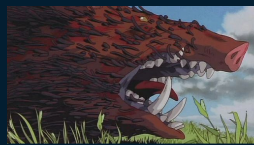
Nago No Kami