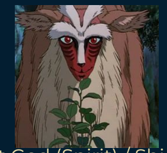
Forest God (Spirit) / Shishigami